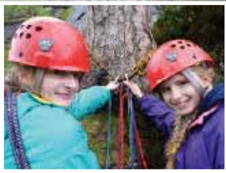
Getting ready to abseil off

Main Photo: On The Gutter on Pine Wall Crag