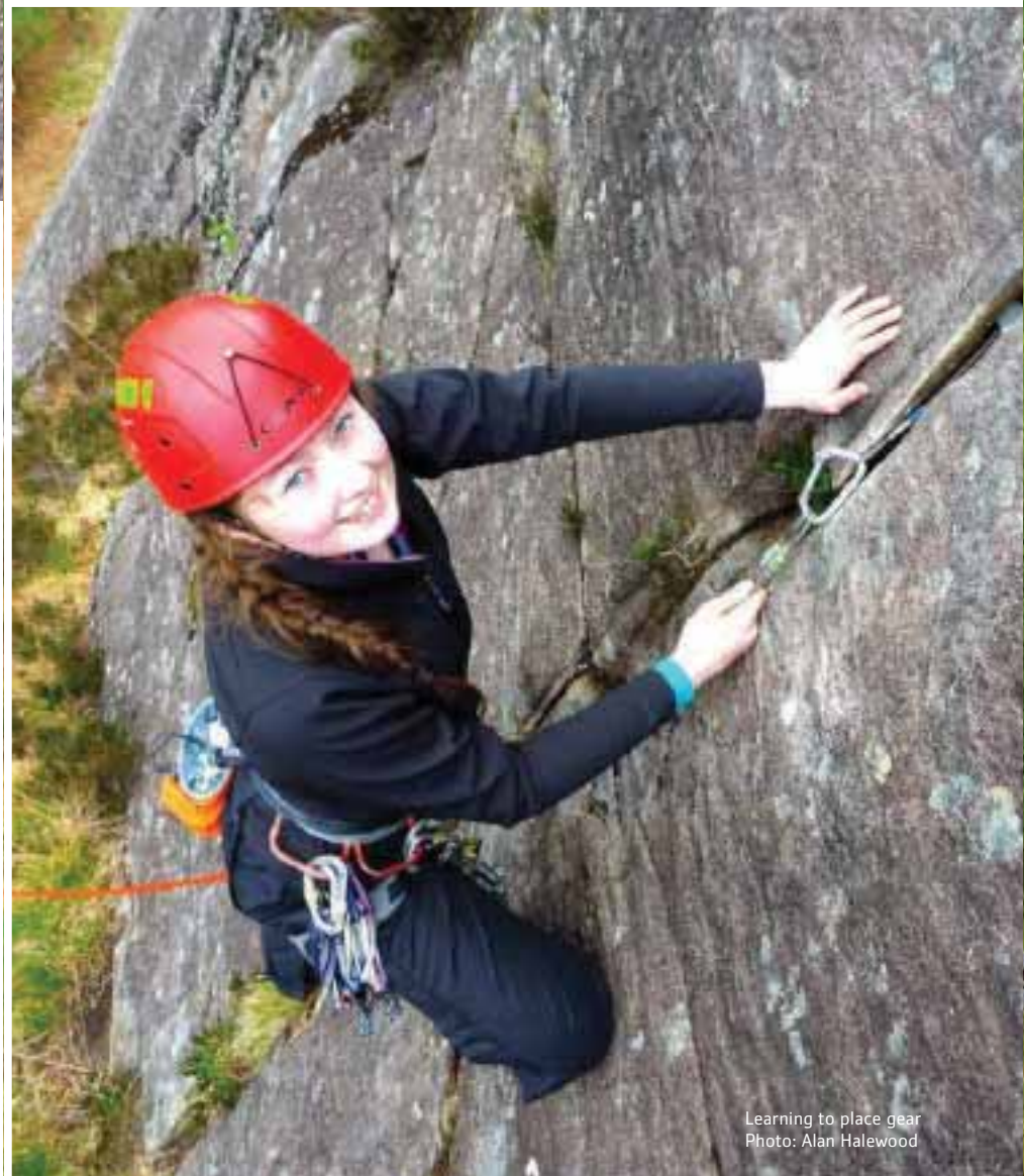
Learning to place gear